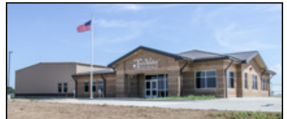
Twin Valley’s open house was held Oct. 9 in Altamont.